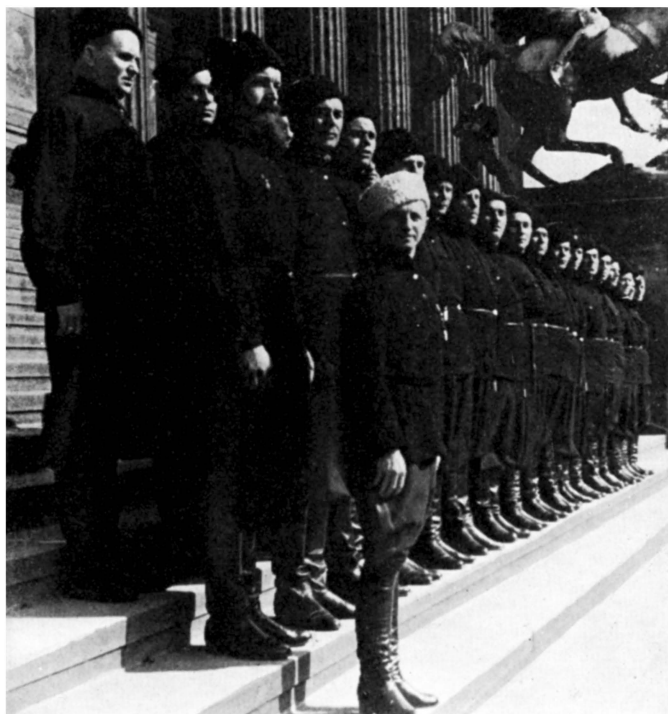
Don Cossack Chorus

The music contained in this album is a recorded miscellany of Russian songs, many of which are on the lips of the brave peoples of Fighting Russia today. The Columbia catalog is rich in recordings by the Don Cossacks. Consult it for a list of the records by this great musical organization. Notes and translations of the songs follow: